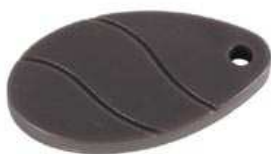
Extra badge: HAA86C/TAG2