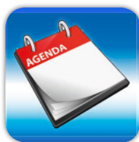
Programmable week timer