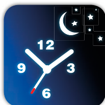
Programmable sleep timer