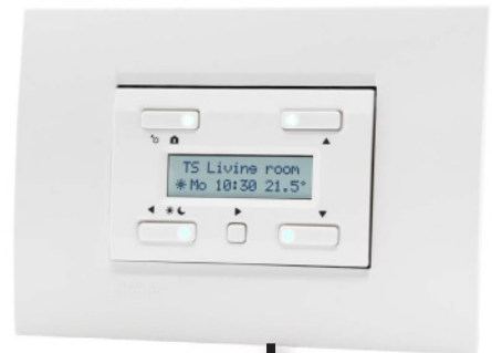
Bticino® frame not included.